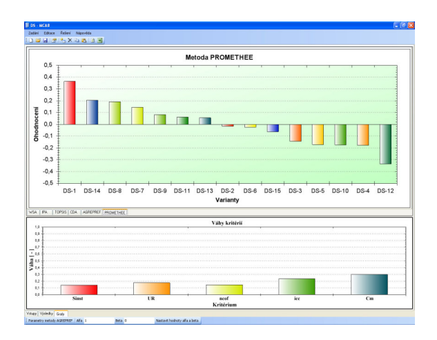
Fig. 4. The graphic output for new "B" weight vector

Fig. 3. The graphic output for basic "A" weight vector The top graph displays final valuation of DSs (their Clear streams) for weights adjusted in the bottom graph. These weights correspond to the basic "A" weight vector. In the bottom graph we can change the arbitrary criterion weight (we can change the column depth by the help of mouse pointer) and watch the changes of the order of DSs in the top graph immediately. The other weights are automatically recomputed. Sum of all weights is equal "1". Figure 4 shows changed order of DSs for a new "B" weight vector.