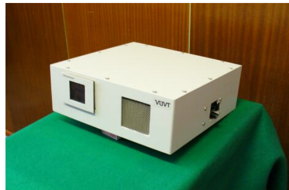
Fig. 3. Prototype 4

The prototype (Fig. 3) represents the class of projection displays with DMD (Digital Micromirror Device) technology. DMD is a matrix of micro mirrors on one chip. The number of micro mirrors corresponds to resolution of VGA, SVGA, XGA standards.