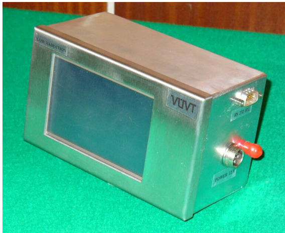
Fig. 2. Prototype 2

Prototype 2 (Fig. 2) is the smallest one in the standard series. It belongs to mobile devices. The supply and filter systems are adapted due to the demands. The prototype input power is minimized. Monochromatic graphic LCD display 6,4 " placed in a ferromagnetic cage and the low power industry computer PC/104 create one unit. Performance of processor Vortex86 is 500 MHz, resolution of LCD panel is 240 x 128 pixels.