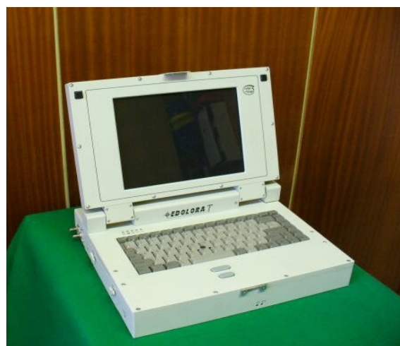
Fig. 1. Prototype 1

Display part is separated from computer part in prototype 1 (Fig. 1). LCD display (10,4 ") is placed into a ferromagnetic cage. Both low input power industrial computer 3,5 " size or PC/104 can be built in the computer part. It is together with keyboard placed in removable part. Performance of processor Intel LV is 400 MHz or Vortex86 500 MHz. Resolution of LCD display is maximum 800 x