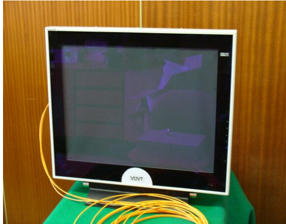
Fig. 4. Prototype 5

has got special shielding mesh that allows using of internal ventilator and enables access of cooling air to lead heat away from projection system.